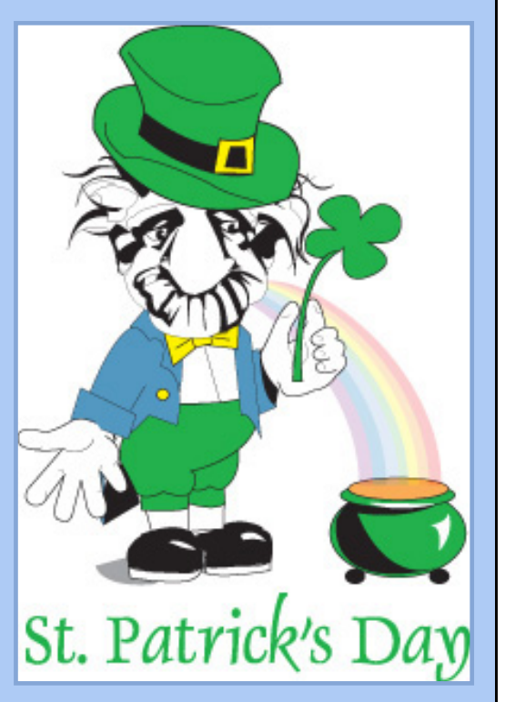
No SUIs (Soldering Under the Influence)

SchmartBoard, Inc. Make Money With Your Website SchmartBoard Distributors SchmartBoard in the Press SchmartBoard Parts Index Pick Your PIC Have You Tried SchmartSolder? Are You New To Electronics? Help Us Design Our Next Product