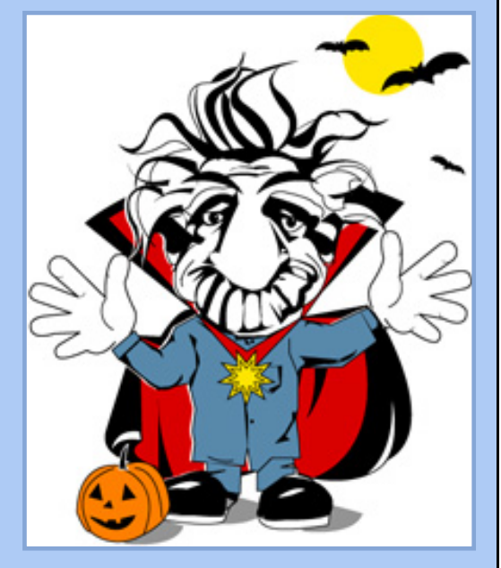
Soldering SMT is just scary without SchmartBoard! Happy Halloween!

SchmartBoard, Inc. SchmartMoney Program SchmartBoard Distributors SchmartBoard in the Press SchmartBoard Parts Index Pick Your PIC Have You Tried SchmartSolder? Are You New To Electronics? Help Us Design Our Next Product