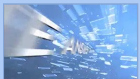
New Schmartboard Promo