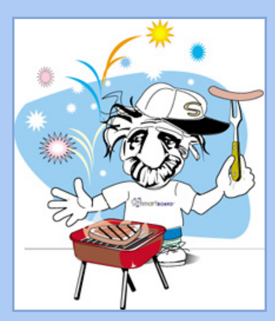
A belated Happy Fourth of July to Our Fellow American Customers and Canada Day to Our Friends Up North

info@schmartboard.com Phone: 925-362-0799