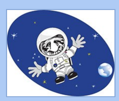
Congratulations to SpaceX!!!

SchmartBoard, Inc. Make Money With Your Website SchmartBoard Distributors SchmartBoard in the Press SchmartBoard Parts Index Pick Your PIC Have You Tried SchmartSolder? Are You New To Electronics? <u>Help Us Design Our Next Product</u>