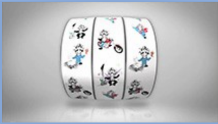
Don't Gamble With Your Next Project