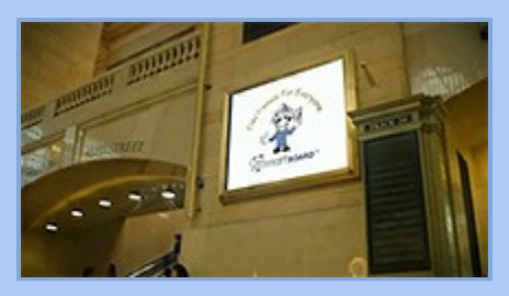
New Commercial Schmartboard is Everywhere