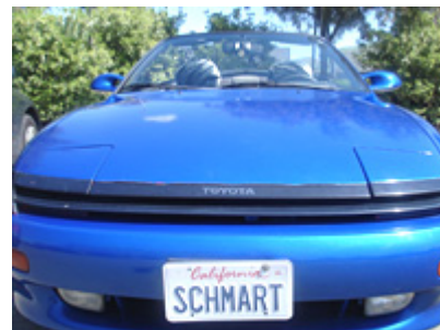
It's Spring....The 2nd Annual Schmarties are Coming!

The 2nd Annual Schmartie Awards are coming. This year the grand prize will be $1000 cash and we'll turn your design turned into a SchmartModule for worldwide sales....Other prizes include an Oscilloscope from Link Instruments, and Boe-Bots from Parallax....More details to come soon.