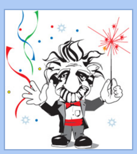
Happy New Year from the Schmartboard Team!

SchmartBoard, Inc. SolderByNumbers SchmartBoard Distributors SchmartBoard in the Press SchmartBoard Parts Index Pick Your PIC Have You Tried SchmartSolder? Are You New To Electronics? Help Us Design Our Next Product