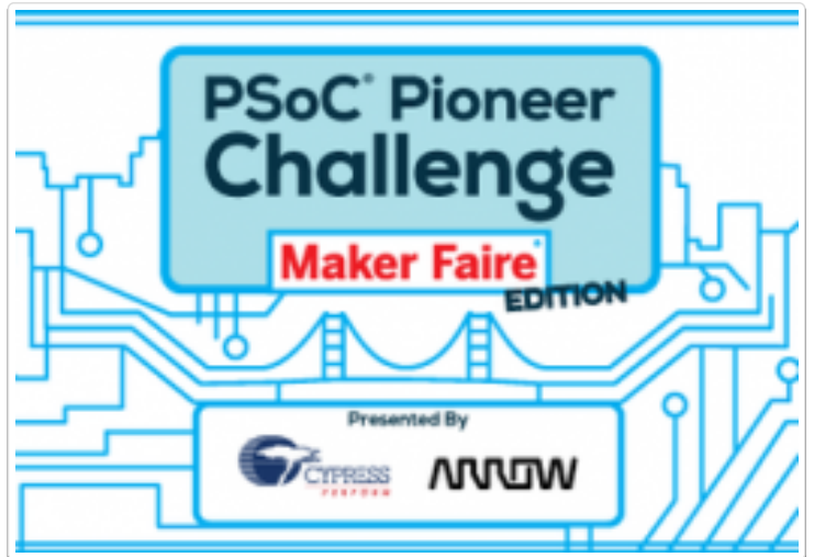
Make: Shared by MAKE