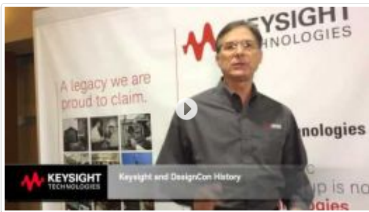
Keysight and DesignCon History Video