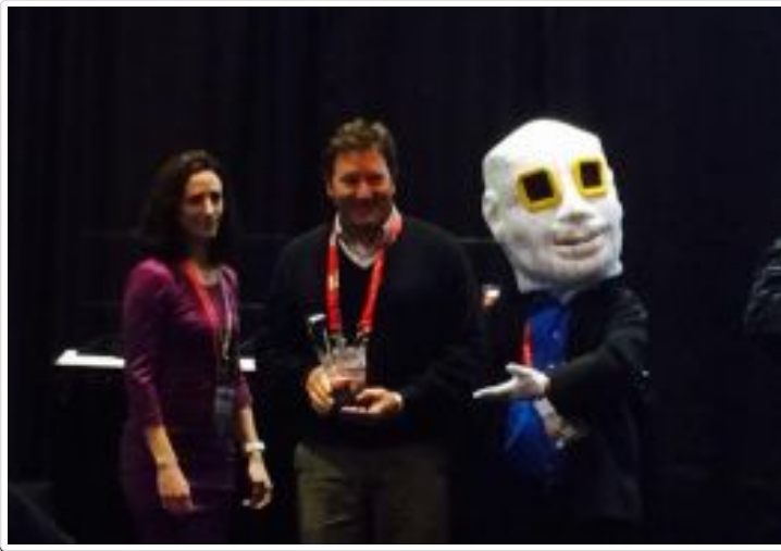
EDN Shared by EDN.com