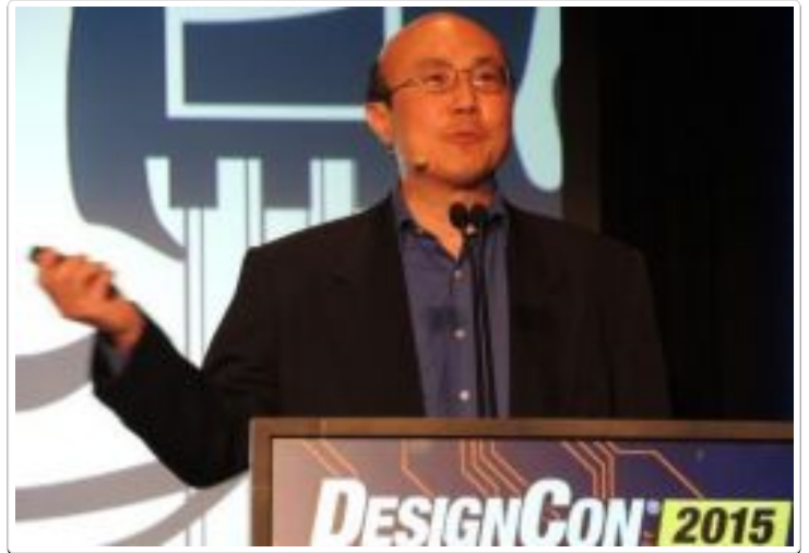
EDN Shared by EDN.com