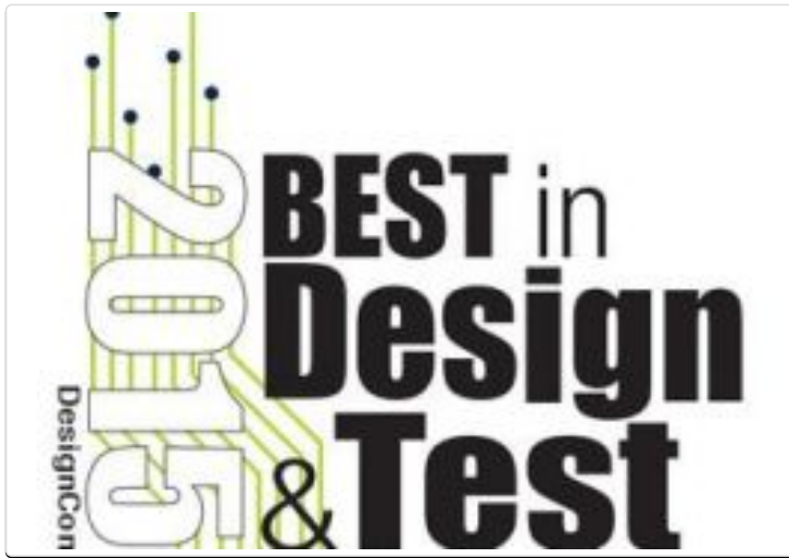
EDN