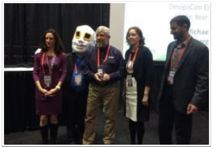
EDN Shared by EDN.com